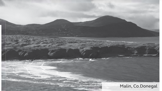
Malin, Co. Donegal